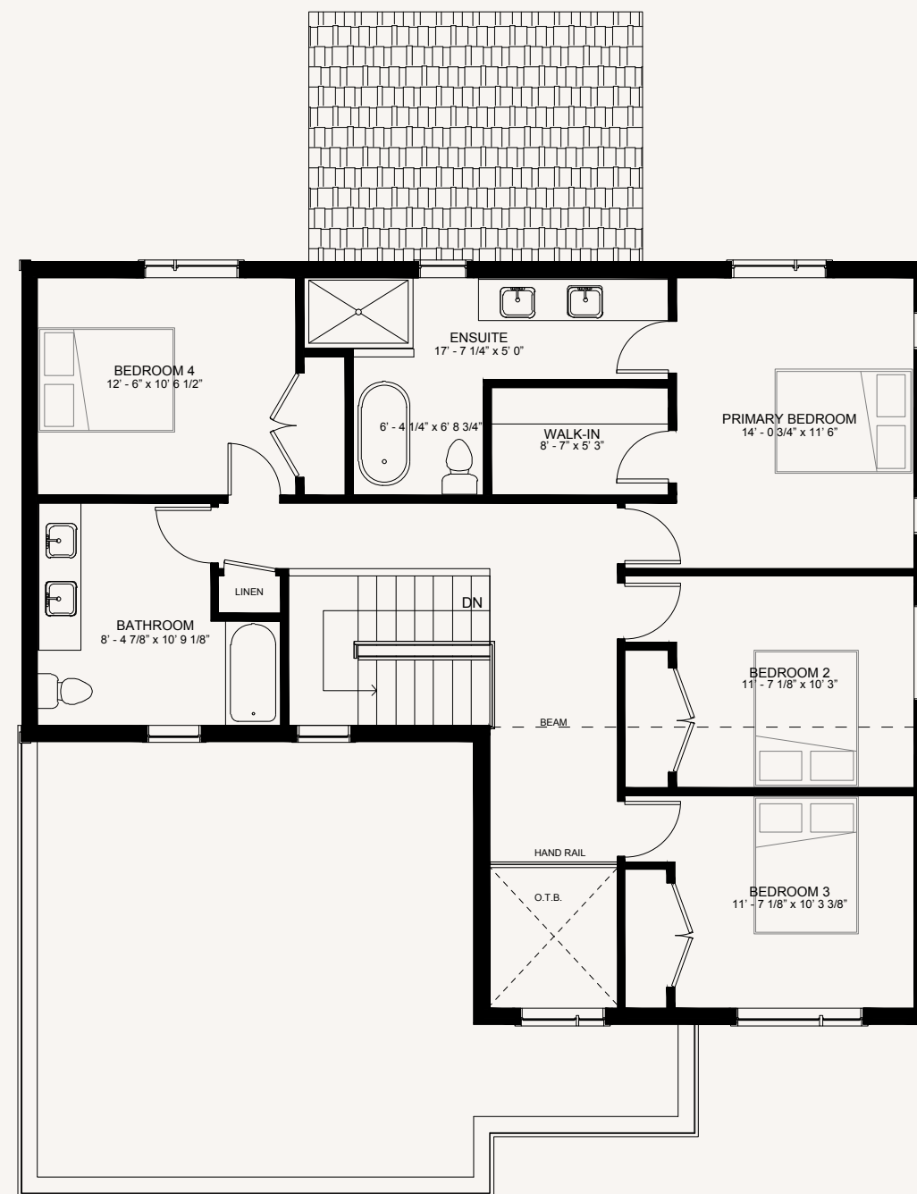
SECOND FLOOR 1202 SQ.FT.