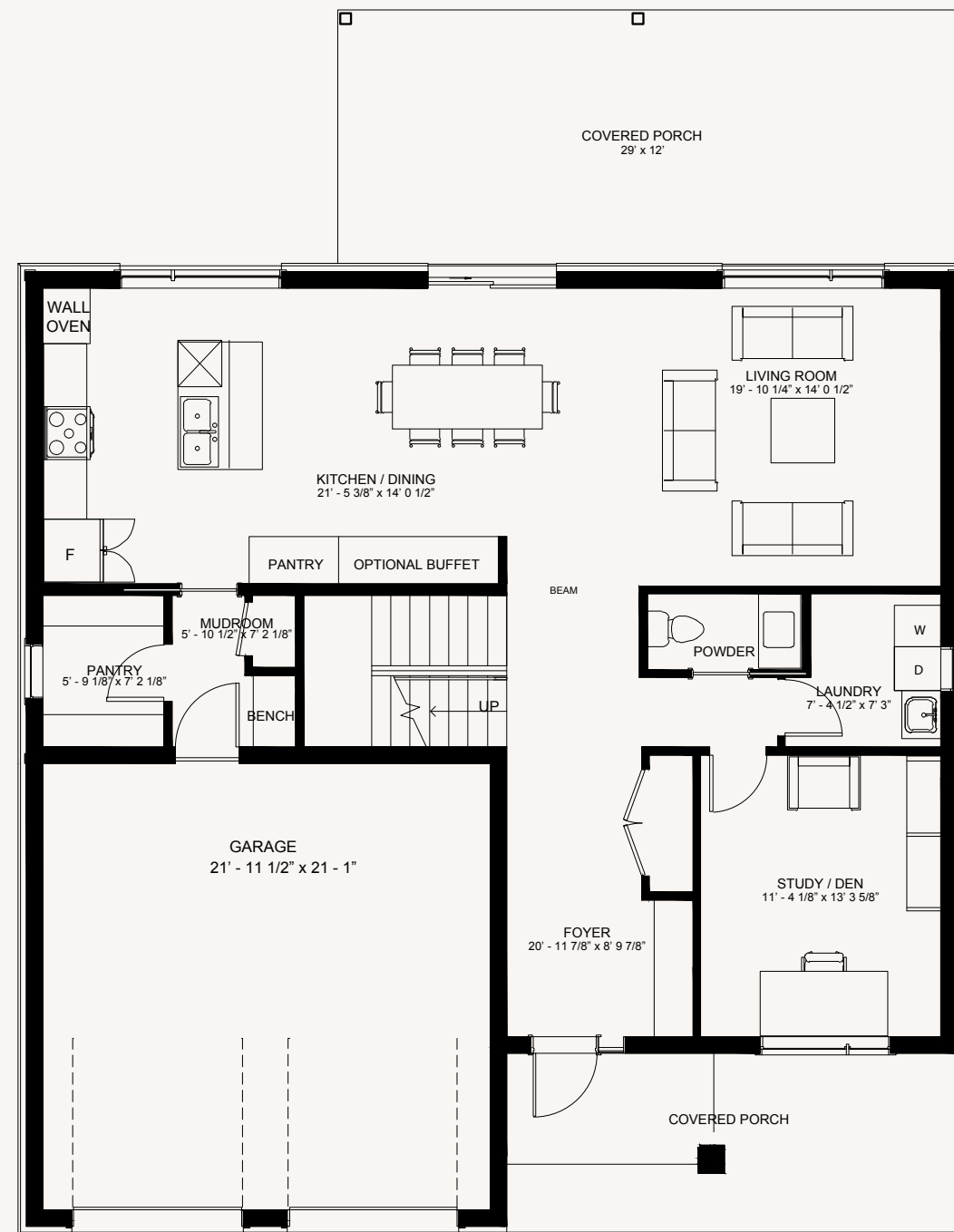
MAIN FLOOR 1317 SQ.FT.