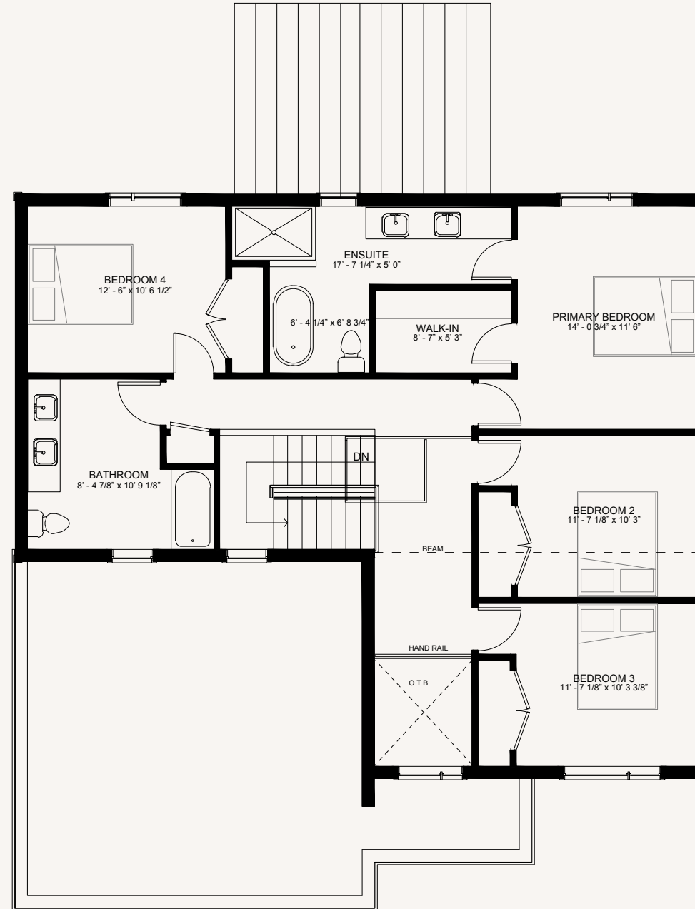
SECOND FLOOR 1202 SQ.FT.