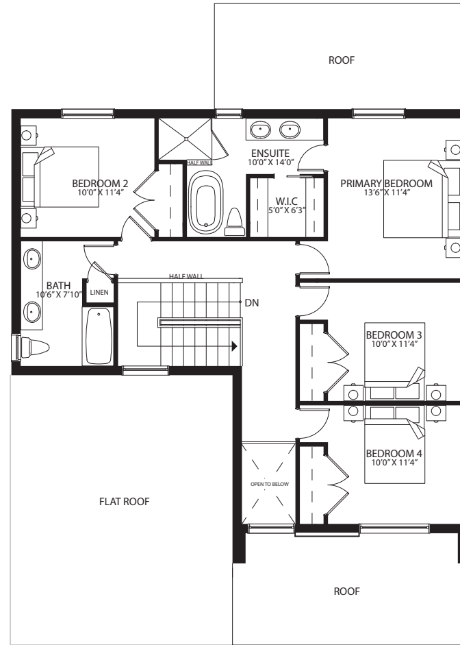
SECOND FLOOR 1048.4 SQ. FT.